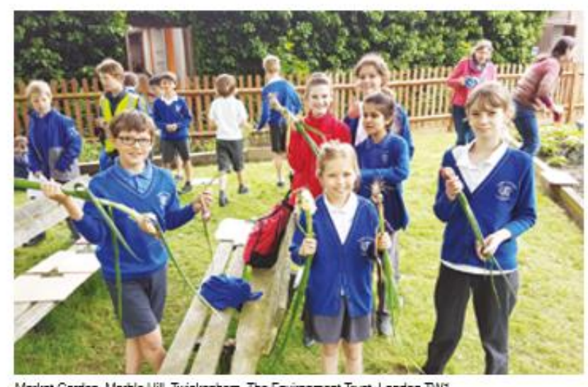
Market Garden, Marble Hill, Twickenham, The Environment Trust, London TW